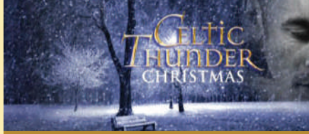
Celtic Thunder Christmas Thursday, Dec. 5, at 7 p.m. CT

N ET brings you the best in holiday programming. Tune in and relax as some new classics and old favorites cheer you and your family in December. Merry Christmas and Happy Holidays, and joyous New Year, from your friends at NET. (All programs on NET1.)