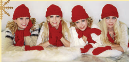
Holiday Christmas with Mulberry Lane Monday, Dec. 9, at 9 p.m. CT