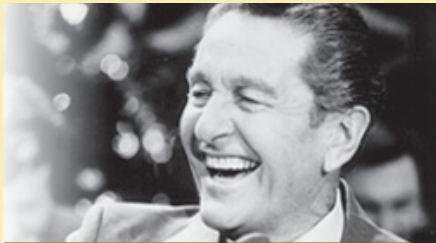
Great Moments and Memories: The Lawrence Welk Holiday Special Sunday, Dec. 8, at 4:30 p.m. CT