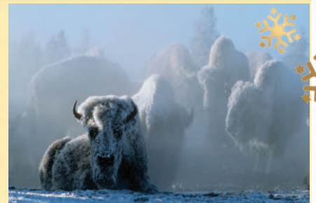
Nature Christmas in Yellowstone Wednesday, Dec. 25, at 7 p.m. CT