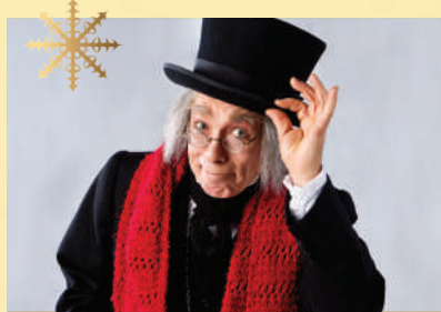
Casting Call to Curtain Call Friday, December 20, at 7 p.m. CT A production of NET Television

This new opera recounts the Christmas Eve truce of 1914 when French, British and German soldiers laid down their arms and spontaneously celebrated peace and humanity.