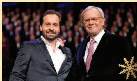
Christmas with the Mormon Tabernacle Choir featuring Alfie Boe and Tom Brokaw Tuesday, Dec. 24, at 8 p.m. CT